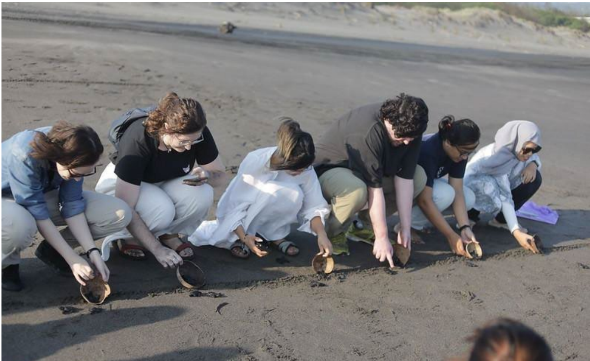
Experiential Classroom: Marine Biodiversity Conservation and Waste Management in Coastal Areas

The Experiential Classroom, introduced last year, merges the most effective elements of the Volunteering and Special Lectures components. It has continued to be well-received by the 2024 cohort. This program provides students with deeper insights into various aspects of Indonesian society, including religion, social, politics, the environment, and culture, through engagement with influential figures and local organizations. One student highlighted, “Engaging with local organizations and leaders gave me practical insights into the social dynamics of Indonesia. It made my learning experience so much richer.”