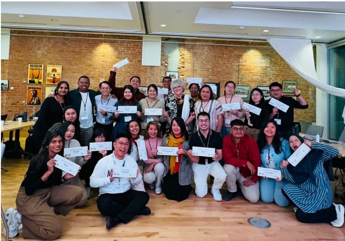
YSEALI PFP 2024 Participants

In preparation for the 2025 YSEALI PFP, USINDO has already been involved in reviewing over 630 applications. Cycle 1 will run from April to May 2025, and Cycle 2 from September to October 2025. For 2025, a total of 48 fellows will be selected, 24 for each cycle.