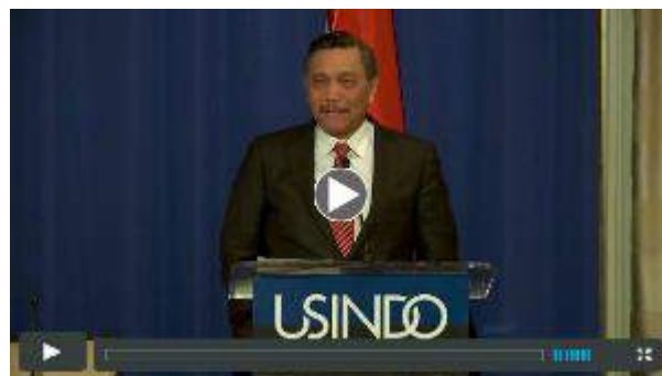
KEYNOTE ADDRESS: H.E. Luhut Pandjaitan