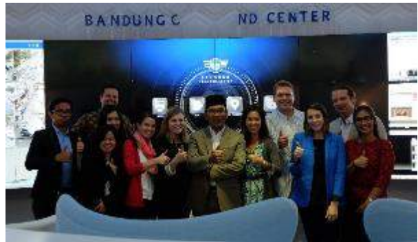
Clockwise from top left: Lunch Meeting with Governor Basuki Tjahaja Purnama (Ahok); Meeting with Hon. Dr. Anies Baswedan, Minister of Primary and Secondary Education and Culture; Meeting with Mayor Ridwan Kamil, Mayor of Bandung; Meeting with Committee on Defense, Foreign Affairs, Intelligent, Communication and Informatics (DPR RI)

Besides meeting Indonesian politicians and leaders, the participants also had the chance to visit Istiqlal Mosque (the biggest Mosque in Indonesia and Southeast Asia), Cathedral Church and historical place such as Asian African Museum, as part of cultural activities.