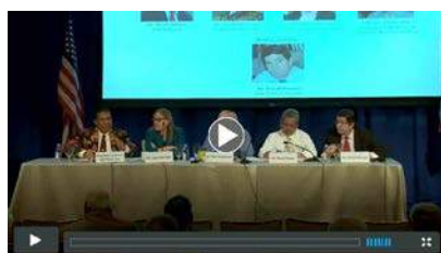
Panel Discussion and Q&A