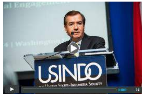
Opening Remarks by The Hon. Edward Royce (R-CA)