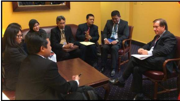
USINDO Legislative Partnership Program participants meeting with Chairman of the U.S. House Foreign Affairs Committee (HFAC), Edward Royce (R-CA)

In Washington, we work in collaboration with the office of House Foreign Affairs Committee Edward Royce, with the House Democracy Partnership, and with the Embassy of Indonesia.