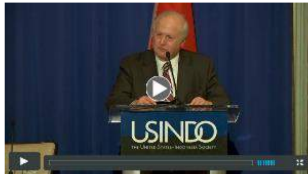
Introduction of Keynote Speaker

His Excellency General Luhut Pandjaitan gave the luncheon's keynote address on " The Priorities and Policies of the Jokowi Administration. "