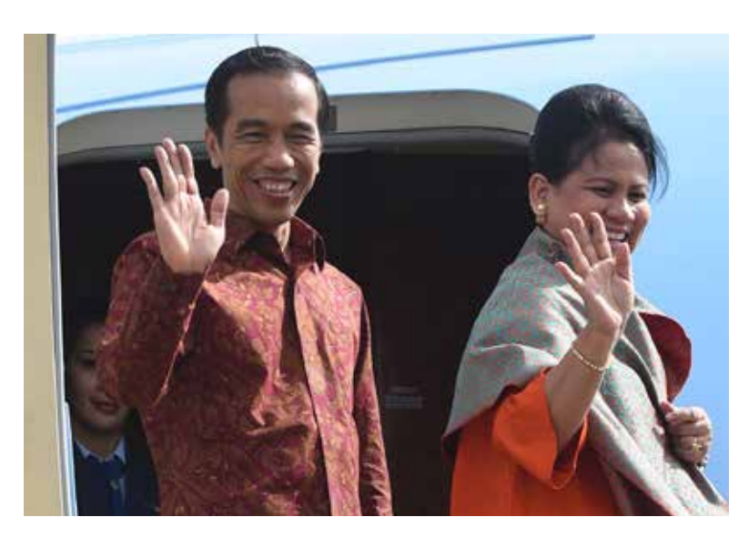
Indonesia's President Joko Widodo and wife Iriana Widodo

vessel as part of the highly publicised assertion of Indonesian control over its fisheries. Indonesia's new fisheries minister Susi Pudjiastuti cancelled a 2013 fisheries MoU with China. Enhanced law enforcement by Indonesian authorities raises the possibility of further confrontations with armed Chinese vessels, which may be harder to de-escalate quietly in the midst of the Indonesian government's high-profile enforcement efforts.<sup>176</sup>