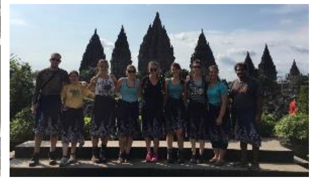
Missouri students visiting central Java.