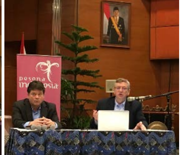
Workshop to senior officials at the Ministry of Tourism, February 5, 2016