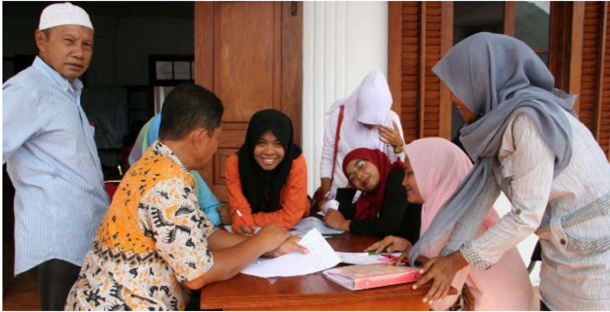
Local Bandanese from four islands gather to identify culturally significant sites within the Banda Islands on November 19, 2015.