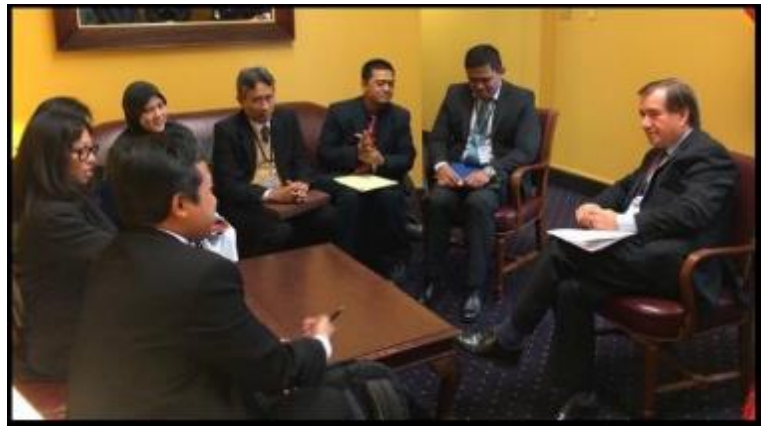
USINDO Legislative Partnership Program participants meeting with Chairman of the U.S. House Foreign Affairs Committee (HFAC), Edward Royce (R-CA)

In Washington, we work in collaboration with the office of House Foreign Affairs Committee, and the Embassy of Indonesia. This year, USINDO also expanded our partnership with the House Democracy Partnership and the U.S. Congress.