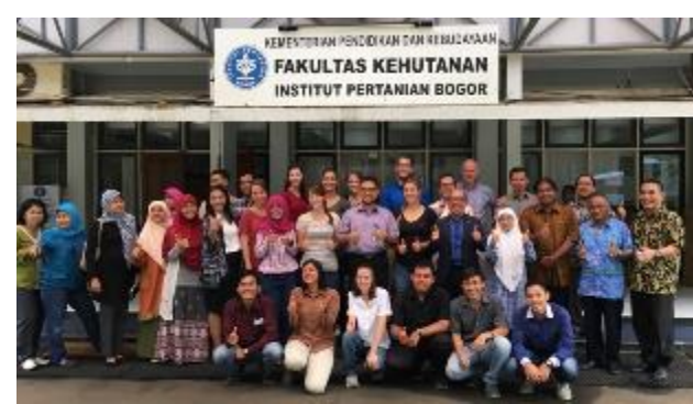
Missouri & IPB students at IPB