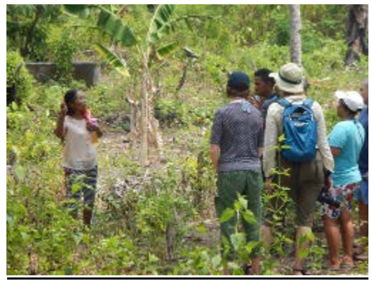
Rutgers & Banda Islands faculty interview locals on land use.