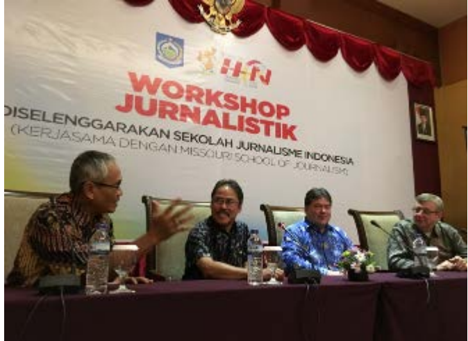
Workshop to over 100 journalists as part of National Press Day, February 9, 2016