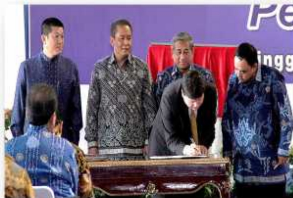
MoU signing between University of Missouri and Indonesian Press Association (PWI) with Minister