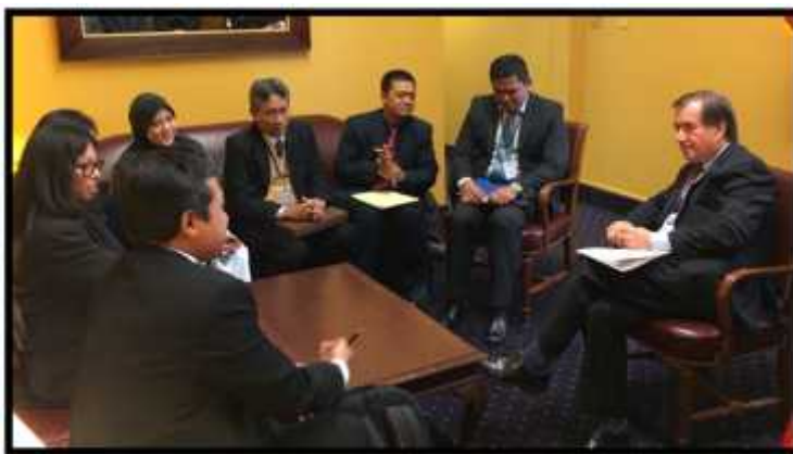
USINDO Legislative Partnership Program participants meeting with Chairman of the U.S. House Foreign Affairs Committee (HFAC), Edward Royce (R-CA).

They also concentrated on substantive foreign affairs issues between the U.S. and Indonesia. Participants discussed the status of the U.S.-Indonesia Comprehensive Partnership and the roles and opportunities for governments, legislatures, and NGOs with U.S. and Indonesian Executive Branch officials. They also built a network of U.S. Congressional contacts which will serve them well in future.