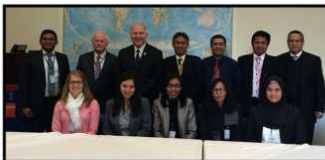
Chairman of the Subcommittee on Asia and the Pacific, Rep. Steve Chabot (R-OH), speaks with participants about Congressional views on Indonesia.

They also concentrated on substantive foreign affairs issues between the U.S. and Indonesia. Participants discussed the status of the U.S.-Indonesia Comprehensive Partnership and the roles and opportunities for governments, legislatures, and NGOs with U.S. and Indonesian Executive Branch officials. They also built a network of U.S. Congressional contacts which will serve them well in future.