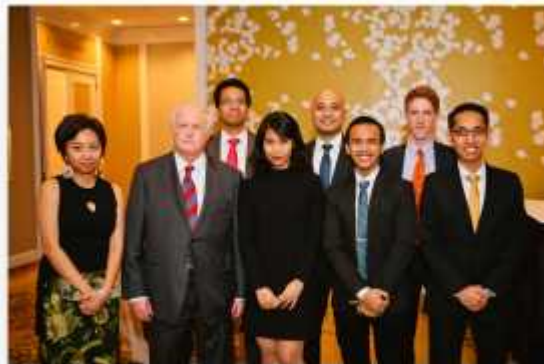
Five Current Edward E. Masters Fellows at USINDO's 20th Anniversary Gala

Five Fellows are currently in their first/second year of graduate study at top U.S. programs of international affairs and international law, and three new Fellows will be joining them in June 2014.