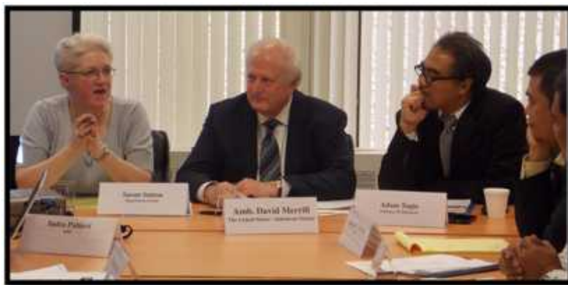
Panel discussion on the US-Indonesia Comprehensive Partnership.

Participant evaluations indicated that the group greatly appreciated the valuable opportunities USINDO's Legislative Partnership Program afforded them. Working with their American peers enabled participants to learn the inner workings of Congress, compare Congressional functions to the Indonesian parliament, and reflect on how the U.S. Legislative Branch may have elements useful for its Indonesian counterpart such as voting processes, public hearings, and the work of the Congressional Research Service (CRS).