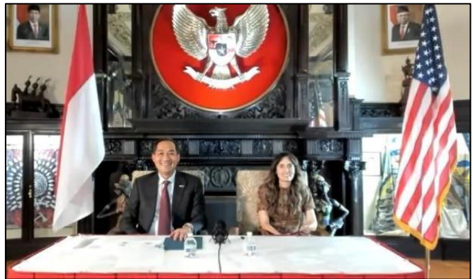
Ambassador Muhammad Lutfi and Ibu Bianca Lutfi during the virtual welcome event

potential to be a globally significant developed country. He saw key factors as (1) investment in infrastructure, combined with a supportive investment climate; making Indonesia an important investment destination; (2) expansion of trade, including increases in exports as a percentage of GDP, balanced with imports as trade grows, (3) workforce improvement through education; and (4) enhancing health care. He stated he seeks an early resumption of GSP for Indonesia, further ways to expand trade, and to utilize several newly available mechanisms to increase investment. An online audience of 300 participated, demonstrating the keen interest in Indonesia's new Ambassador to the United States.